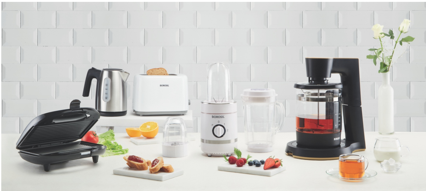
From mixer-grinders and blenders to toasters, ovens and grills Borosil's range help our consumers perform beautifully.