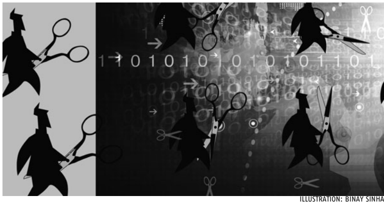
ILLUSTRATION: BINAY SINHA

However, there is lack of clarity with respect to functions like reassessment, transfer of existing cases, domestic transfer pricing cases and dispute resolution process for transfer pricing cases, among others, leaving tax officers perplexed. Amid the largescale overnight transition, doubts have also emerged over